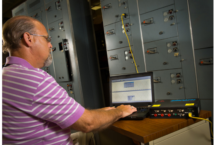
Users can acquire motor control center (MCC) data without opening the MCC door.

For both voltage and current measurements, the frequency response is DC to 5000 Hz, minimum.