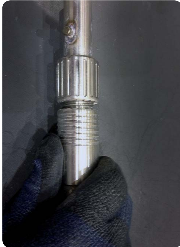
AREVA's exclusive light weight poles have been tested under rigorous conditions and are technician-approved.