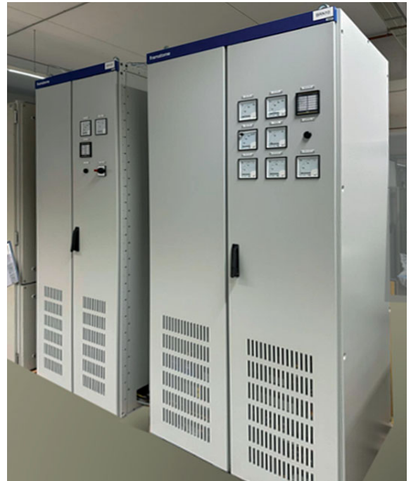
Safety UPS System (Rectifier and Inverter) for Nuclear Power Plant