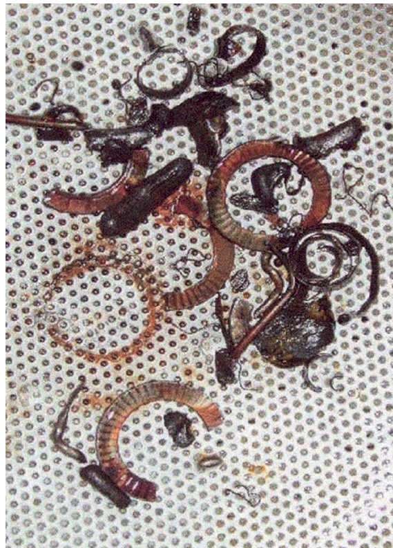
Debris removed from coolant circuit