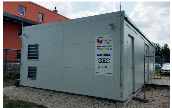
Battery storage system in a 40' container

Despite volatile energy sources, the high availability of stored energy creates security of supply in cities, buildings, infrastructure and industry.