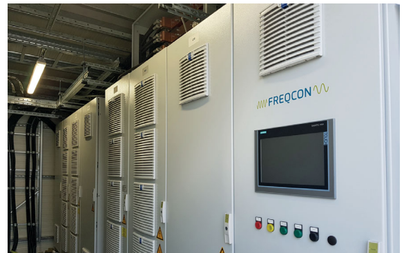
Power electronics switchboard