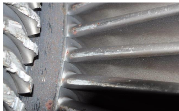
Fractured blades of industrial steam turbine