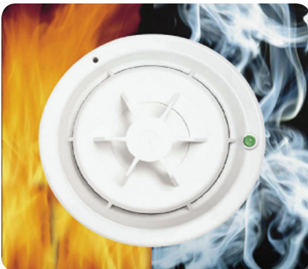
State-of-the-art Fire Alarm System Technology

With more than 40 years of nuclear power plant fire protection engineering experience and 15 years of fire alarm system modification/implementation experience, Framatome can deliver comprehensive fire alarm system solutions to help resolve the obsolescence/compliance issues for meeting the plant extended life. These comprehensive solutions are based on decades of field-proven project and systems analysis experience. It is all about mitigating fire alarm system operational cost pressures with innovation backed by global technological leadership from a single, responsible source.