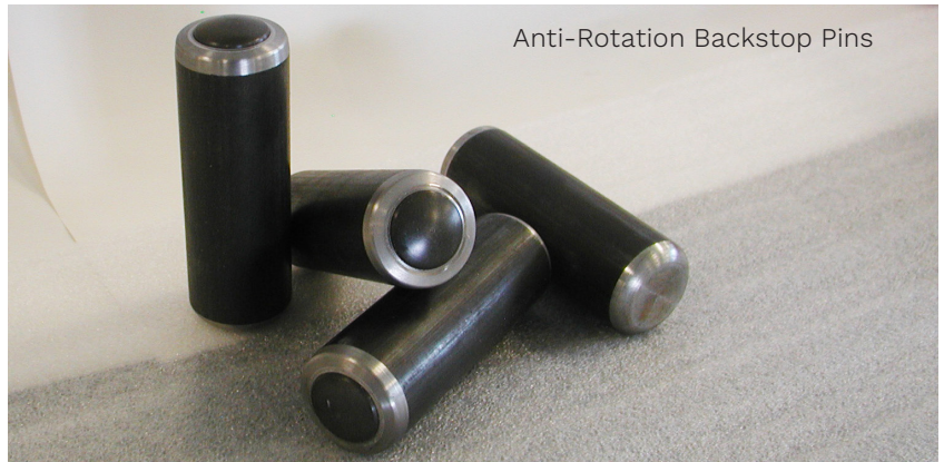
Anti-Rotation Backstop Pins