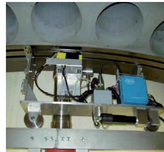
RV Head Flange Inspection Tool