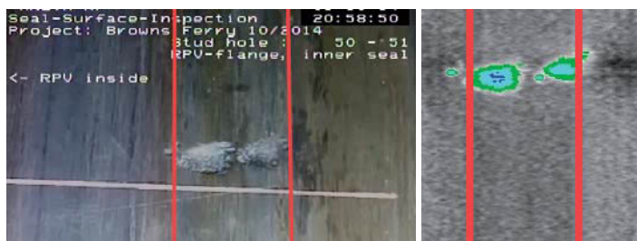
Visual indication on left