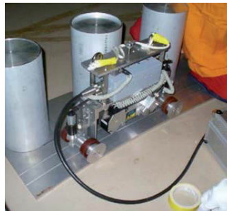
RV Flange Inspection Tool