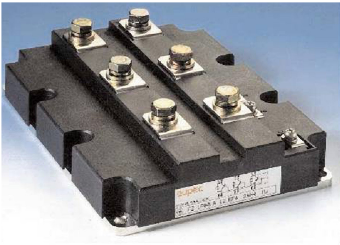
IGBTs from the market leader in IGBT technology.

Siemens SINAMICS PERFECT HARMONY GH180 VFDs significantly reduce maintenance. By replacing aging equipment, VFDs can reduce parts requirements, eliminate mechanical linkages, scoop tube adjustments and oil handling concerns with M-G sets.