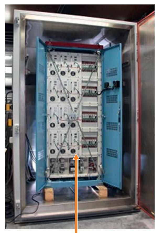
Example of cabinet