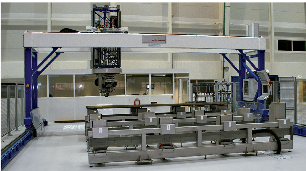
Linear Gantry System for contact technique with multiple phased array probes and automated component support

Your performance is our everyday commitment