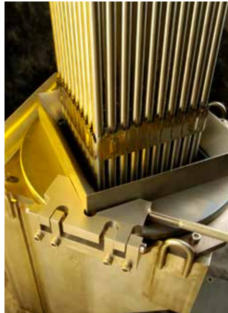
Fuel Assembly Rotating Support (Lazy Susan)