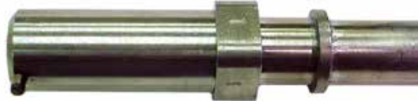
Rod Storage Capsule (Cap Installed)

Framatome offers standard ready-to-deploy tooling designs, as well as innovative customized designs to safely and efficiently solve your specific fuel handling challenges. Upon request, on-site services can be provided to install and operate the tooling, as applicable.