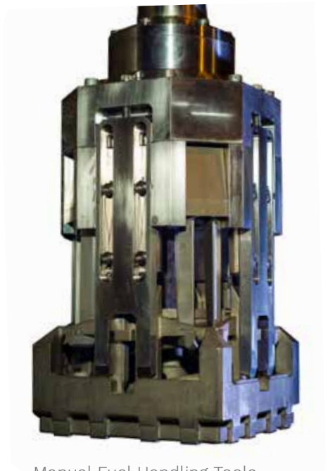
Manual Fuel Handling Tools

Contact: sales-fuel@framatome.com www.framatome.com