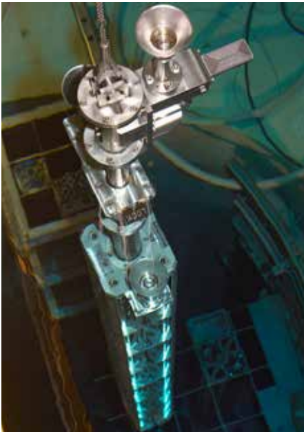
Control Rod Changeout Tools