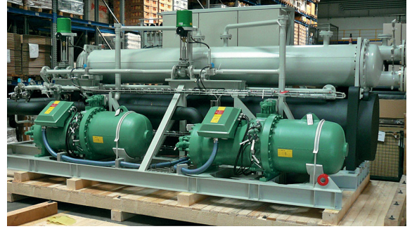
Testing of HVAC systems for nuclear qualification

All our HVAC and chiller systems fulfill the requirements of ASME, ENSI, KTA, RCCM and RCCE.