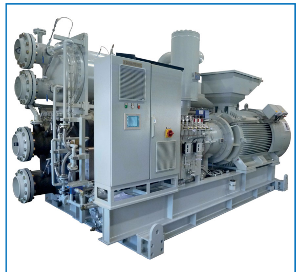
Refrigerating machine with open drive centrifugal compressor

Framatome's HVAC equipment and the unique integrated chiller control systems (TELEPERM XS) undergo an extensive nuclear qualification process. The HVAC systems stabilize specified temperatures, pressures and humidity levels suitable for reliable operation of safety-relevant equipment. Our original equipment manufacturer experience and various retrofitting projects ensure optimized plant layout integration and significantly simplify authority acceptance.