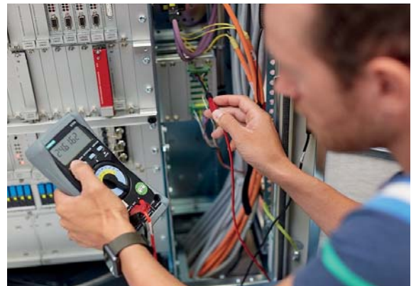
Our nuclear specialists ensure the long-term operation – with services that go far beyond standard