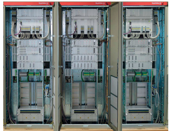
Dual channel turbine controller based on TELEPERM XS

An optional built-in plant simulator can be activated during outages. It enables any desirable dynamic tests in single mode, as well as in interaction with other plant and I&C components such as true valves, control room, process computer, etc., and can also be used for staff training.