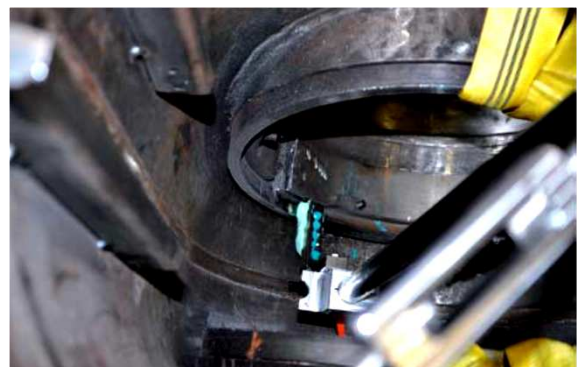
Investigation of a valve inaccessible with conventional methods