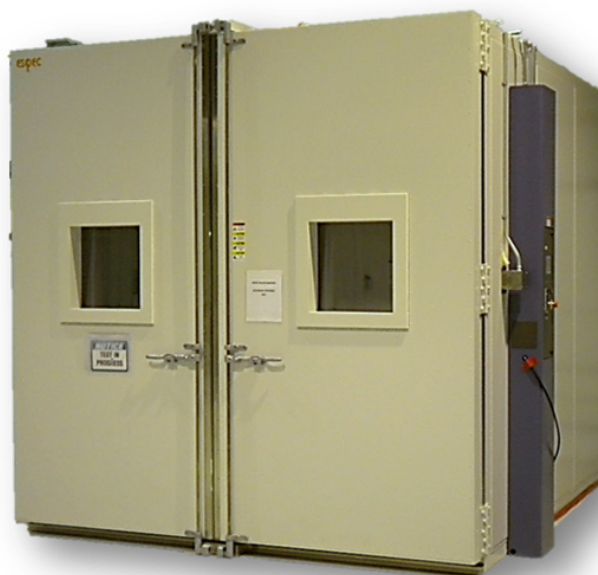
Framatome's large chamber can accommodate most components without disassembly, allowing for operational tests.