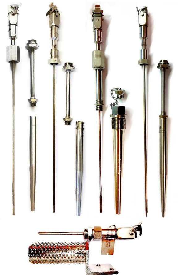
Selection of different temperature sensors types (pipe-mounted on top, ambient on bottom) with various accessories

Additionally, tailor-made designs can be engineered and qualified.