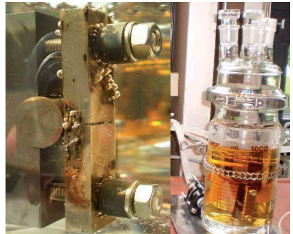
Crack initiating attempt at notched bend test specimen under medium conditions