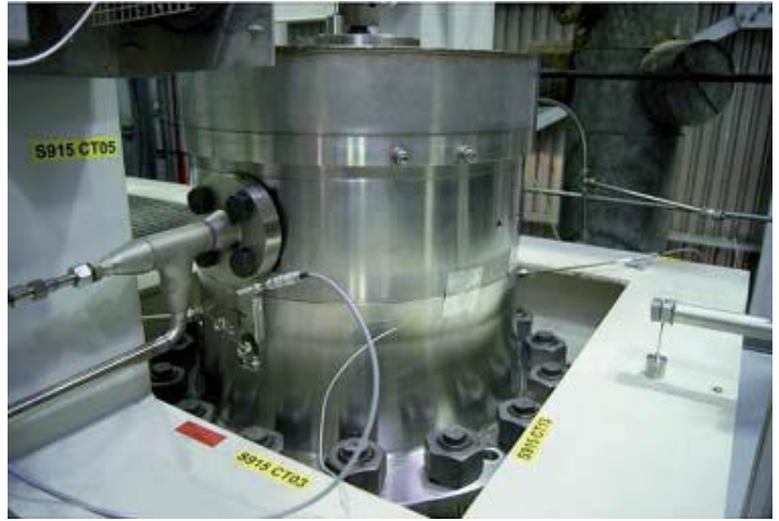
Instrumented specimen connected to leak-off lines