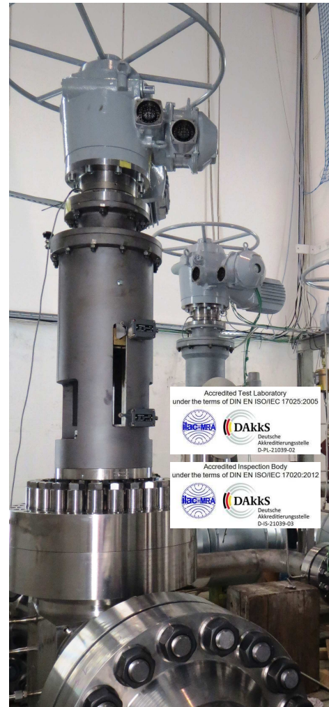
DN350 specimen mounted on the test loop