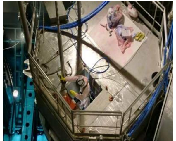
Working platform and biological shield