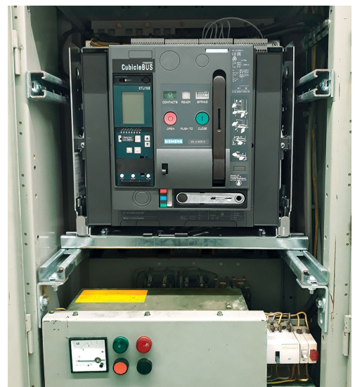
3WL air circuit breaker in N1960 switchgear

Contact: Electrical-systems@framatome.com www.framatome.com