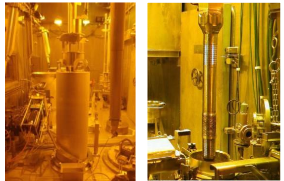
© Engineering & Operating Sodium Cold traps treatment solutions