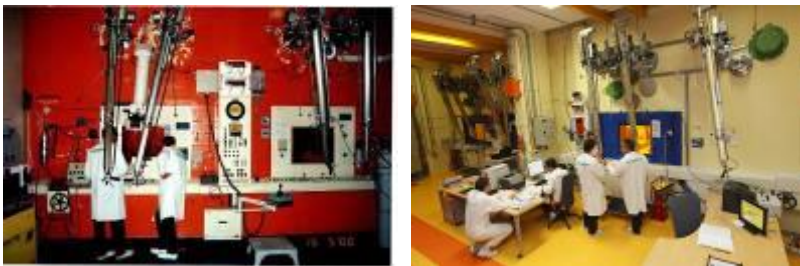
© LECA complete refurbishment of main hot cell complex (left: before, right, after)

HIFRENSA – Spain: Vandellos project (1993-1997, 1 hot cell)