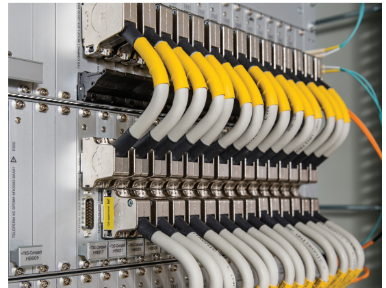
Typical configuration of TELEPERM XS Compact rack.

The solution is developed 100% in-house so there is no external IP or black box. This ensures long-term product availability and ongoing support with licensing. The supply chain and production infrastructure for this product are mature, improving lead time and component availability.