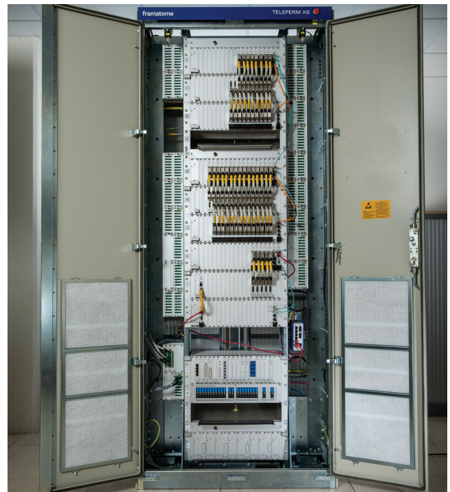
TELEPERM XS Compact assembled in cabinet