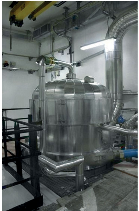
Installed evaporator unit

Engineering, component design, and manufacturing is freely adaptable according to various standards (EU, US, China etc.)