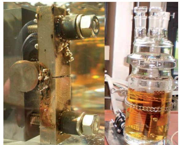
Crack initiating attempt at notched bend test specimen under medium conditions