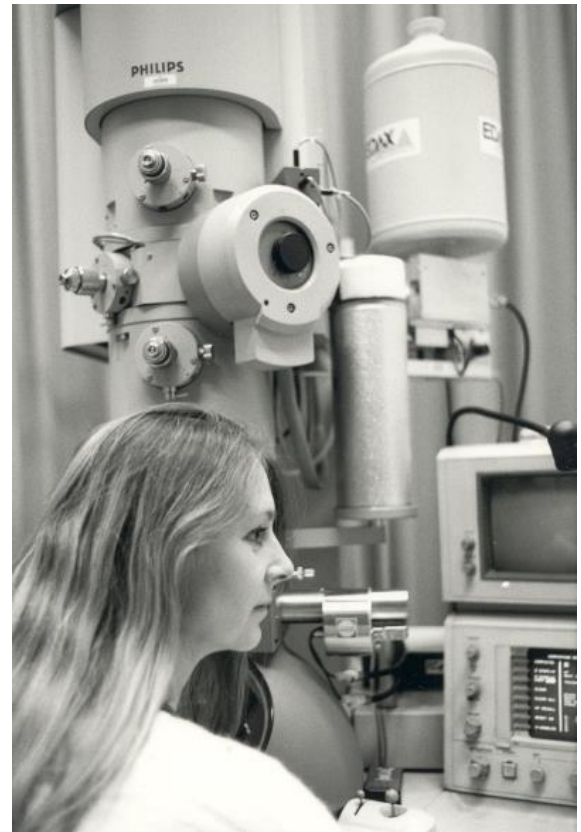
Scanning electron microscope